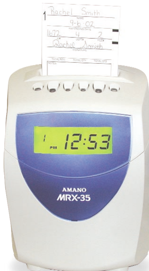
Reliable and economical.